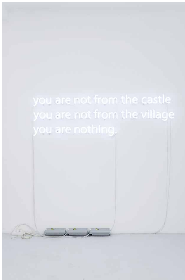
Claire Fontaine, Untitled (You are not from the Castle, you are not from the village, you are nothing.) , 2015. © Claire Fontaine — Photo Aurélien Mole. Courtesy Air de Paris, Paris.

→ Claire Fontaine is represented by Mennour and Air de Paris.