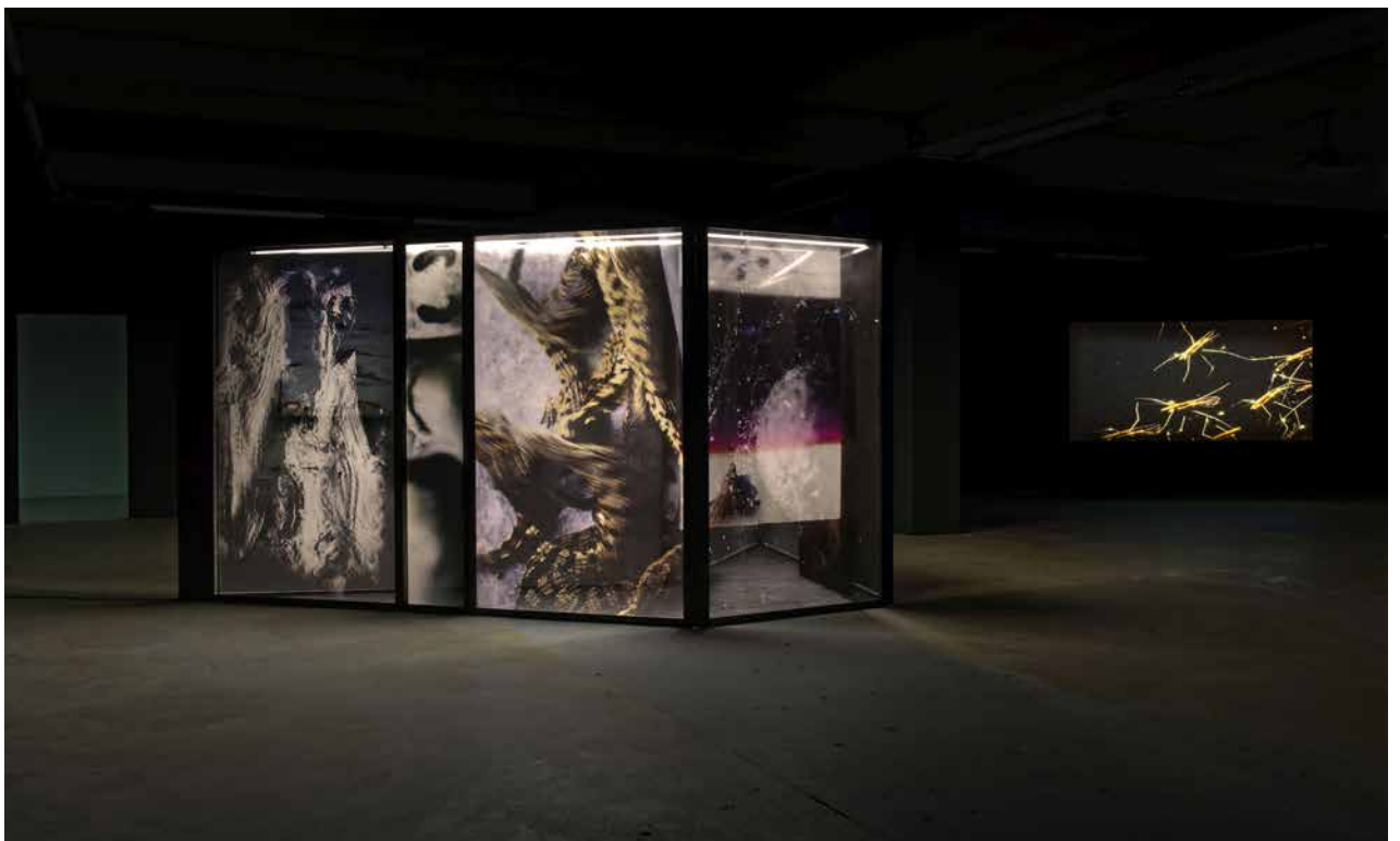
Anne-Charlotte Finel, Exhibition view of Respiro , CAP • Saint-Fons, 2023, photograph by Blaise Adilon.

CAP has become a platform where art emerges, takes shape, and is exhibited.